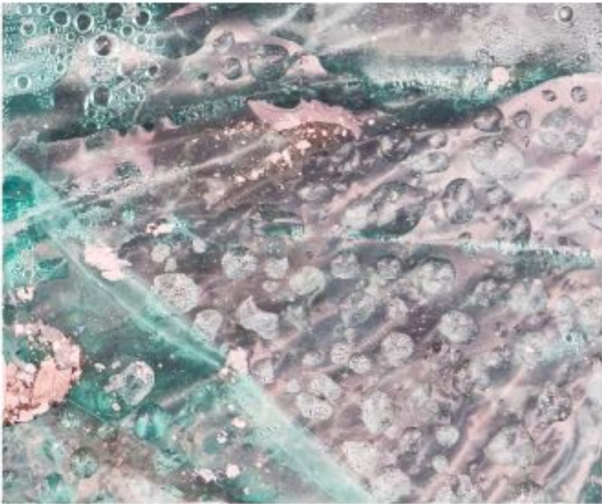
Yui Onodera Substrate / The Garden det024