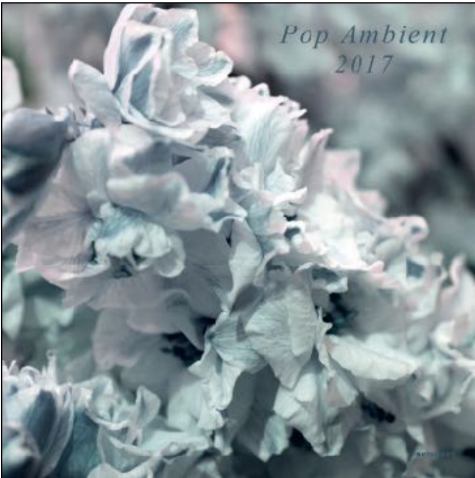
Pop Ambient 2017